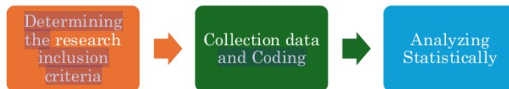
Gambar 1. Prosedure Meta-analysis

inclusion criteria, 2) collecting data and coding, 3) analyzing the data statistically dapat dilihat pada Gambar 1.