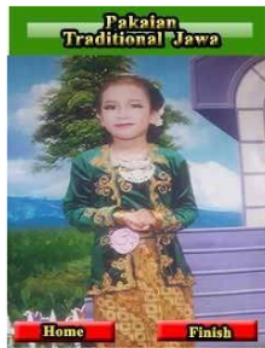
Fig. 3 Javanese Traditional Clothing

Interface design is very important in software development, especially in developing game applications. The user interface is a bridge of interaction between the user and the system, besides that the design of the characters and characters in the game must also be planned properly and attractively. So that users will feel comfortable and interested in playing games. The interface design must also be able to describe the value or story that will be conveyed in the form of a game to the user. The designed essays are then translated into code through events to implement the logic of the program. This implementation process is carried out on the development software. The product made is an android app that contains local culture-based interactive English reading learning game for primary school students. This app can be accessed on smartphone or tab that operated in android operating system (OS), as a result, students enable to learn independently in anywhere and anytime. Figure 3 illustrates the application game interface installed in android OS-based smartphone or tab