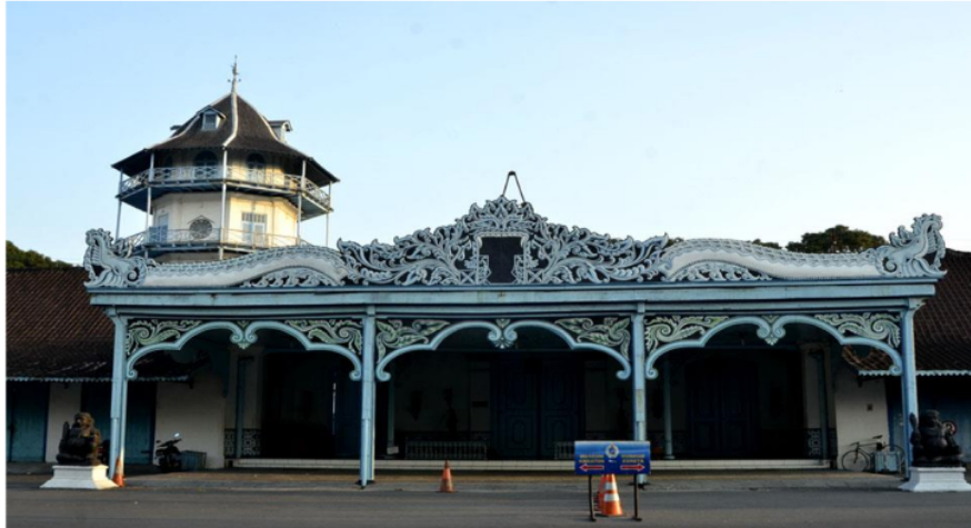
Figure 3. Keraton Surakarta, where Pakubuwana IV reigned in 1788-1820