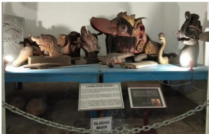
Figure 6 Canthik Rajamala Boat in Radya Pustaka Museum