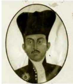
Figure 1. Pakubuwana IV King of Kasunanan in Surakarta Palace