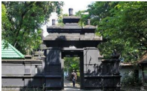
Figure 2. The tomb of Pakubuwana IV in Imogiri, Yogyakarta, Indonesia

Tourism is everything related to the implementation of tourism. People who do tourist activities are called tourists. In tourism, literature is included in the category of Tourism Objects and Attractions (TOA), which is anything that makes it an attraction for tourists to visit whether they come from nature, culture, or special interests. As part of TOA that comes from culture, Wulangreh deserves a portion that needs to be considered (Sudarmanto, 2020). So regarding literary tourism in this article, it means that tourists can read or understand about the Wulangreh text in the palace library, by visiting the Surakarta palace where King Pakubuwana IV, the author of Wulangreh , once reigned, and visiting the Radya Pustaka museum where Wulangreh was kept, visiting the tomb of Pakubuwana IV (Figure 2) in Imogiri, Yogyakarta.