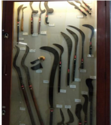
Figure 5. Traditional Weapons at the Radya Pustaka Museum