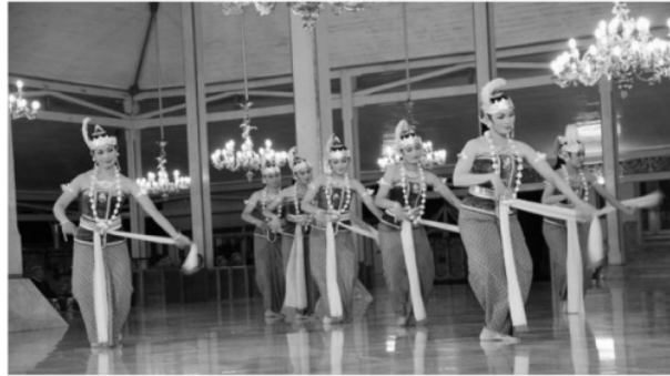
Figure 4. Srimpi Muncar's Dance from Kraton Mangkunegaran, Surakarta.