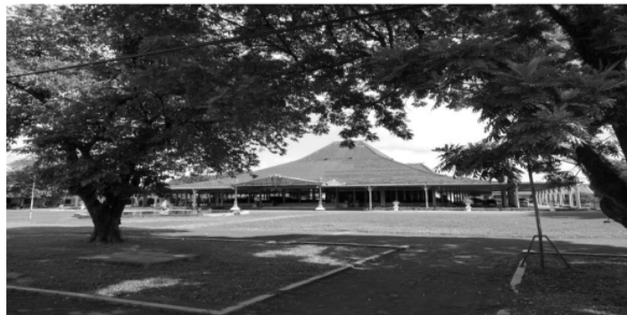
Figure 2. Mangkunegaran Palace

Places that can be visited in literary tourism include Mangkunegaran palace (Figure 5) which has many variations of events and attractions that tourists can enjoy, including: Mangkunegaran special dance offerings (Figure 7) and Mangkunegaran style lunch, Mangkunegaran library, study together at the Mangkunegaran Academy, and the bazaar at the Mangkunegaran pavilion. This is the pride of our homeland as part of a culturally rich Indonesia (Palavan, O., & Kozaner Yenigül, C.,2021).