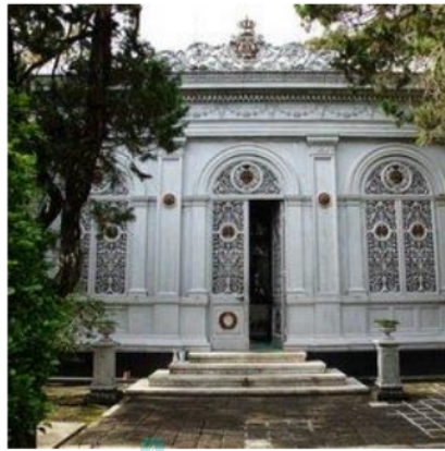
Figure 1. The cemetery Girilayu, Karanganyar

At a time like this where the issue of racism and intolerance spreads out at the national and global levels, then a real effort is needed to address it. Several ways can be done through various approaches, one of which is through a cultural approach. In line with that, the publication of research results "Javanese Local Wisdom in Wedhatama " by Ismawati & Warsito (2019), clearly has a strong relevance to overcome various problems of the Indonesian people, including the issues mentioned above (indepht interview with RM Darajadi Gondodiprojo, 2019).