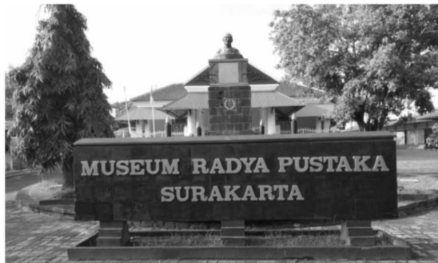
Figure 3. Radya Oustaka Museum in Surakarta.

Destination countries and societies are always confronted with the seasonality in their tourism planning and management. This is a major challenge and notable barrier to achieving tourism sustainability. Seasonal mass tourism ignores the carrying capacity limitation of the destination, destroys cultural and environmental assets, puts pressure on precious natural resources, creates job uncertainty, and generates unsustainable conditions in the destinations (Seba, 2012).